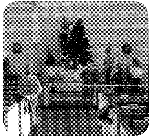
The Decor committee and other volunteers decorating the sanctuary for the Christmas season.