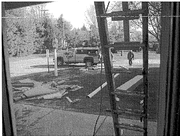
View of roof activity from church office.