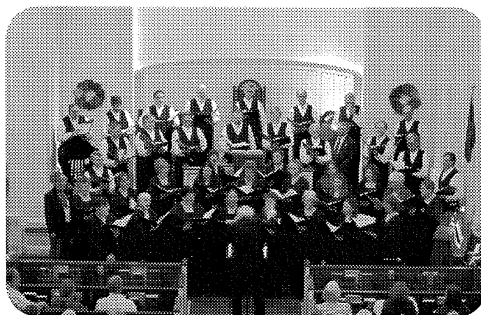
The Heritage Chorale in concert November 28th.

The new year is a time for new beginnings, so this year we will try a new choir venture. On the third Sunday of each month, we will bring the choir downstairs and invite any one who would like to sing, to join us. We will rehearse downstairs, in the front of the sanctuary at 9:15 that Sunday morning. The anthem will be easy. It may be unison or in parts, but you do not have to read music to sing with us. It may be a hymn, or an old favorite, or a new selection. Regular choir members will be a part of this group and will lead us along, so participation will not be difficult.