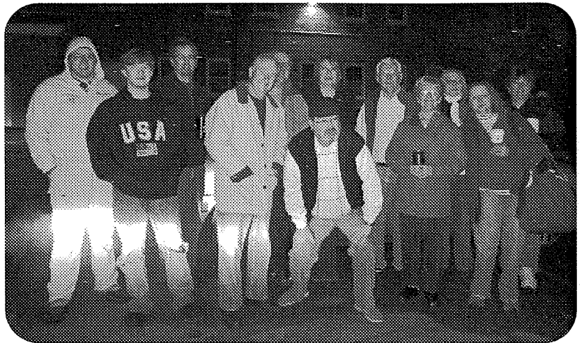
Happy New Year! At 6 AM on January 1, the Mississippi crew prepares to hit the road.